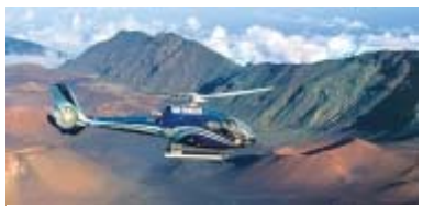
Prices vary by tour selection

The following tours feature what we feel are some of the finest Tours & Activities Hawaii has to offer.